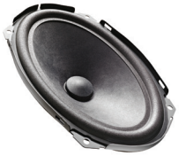
2 x 217 mm subwoofer