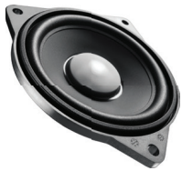
5 x 100 mm ALumaprene midrange speakers