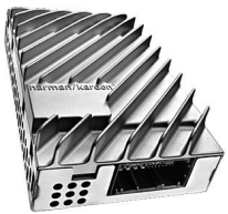
Harman Kardon® DSP amplifier in Class-D technology with 280-watt total output