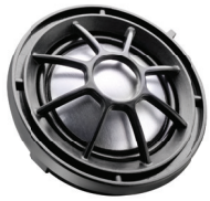
5 x 26 mm metal-matrix dome tweeters